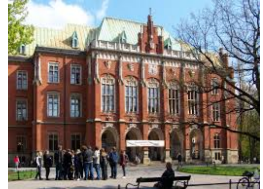
Jagiellonian University in Cracow, est. 1364