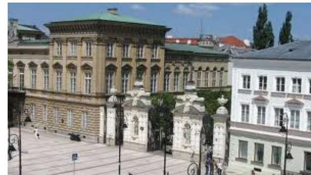
University of Warsaw, est. 1816