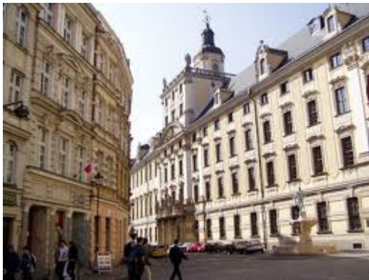
University of Wrocław, est. 1702

Statutes of three prominent, Polish public universities: